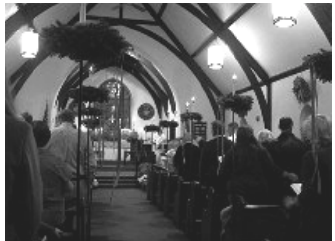
Christmas Eve at St. John's.

Once again our choir will participate with several other choirs at the service for Christian Unity to be held on Thursday, January 19, 2012 at 7:30 in the evening. This year the service will take place at Chews Methodist Church right around the corner from us on Black Horse Pike. Mark your calendars now for a service that is always a delight to attend and an opportunity to support our fabulous choir!