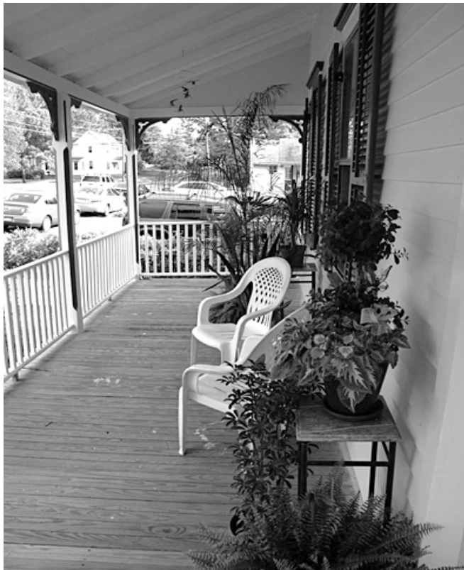
Porch of the former rectory.