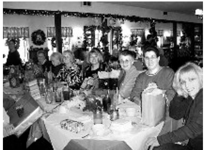
On December 5th our ECW ladies enjoyed their Christmas luncheon at the Carriage House Restaurant where they exchanged Pollyanna's.