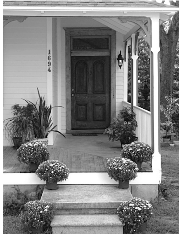
Entrance to the former rectory.