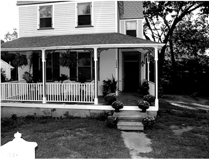
The former St. John's Rectory as it appears today.