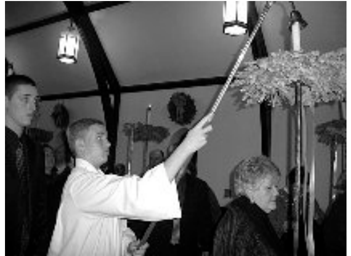
Acolytes lighting the church on Christmas Eve.