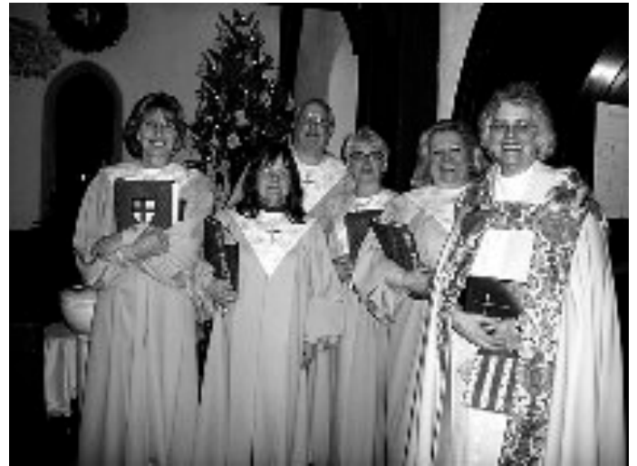
"O sing unto the Lord a new song".