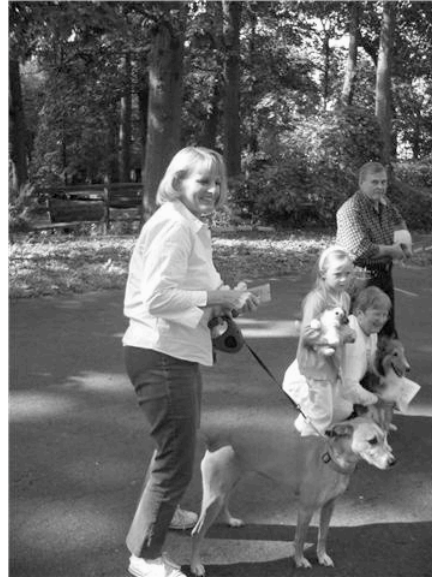
More Blessing of the animals from October 4.