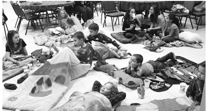
'Movie Night' with the children ready to watch " The Polar Express ".