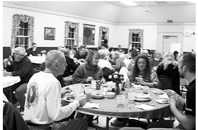
Food, fun and fellowship, enjoyed at the St. John's annual 'Spaghetti Dinner'.