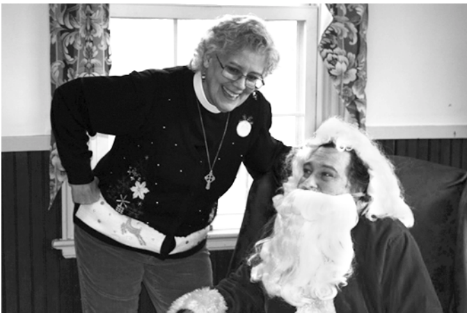
"...and were you a good girl this year?"