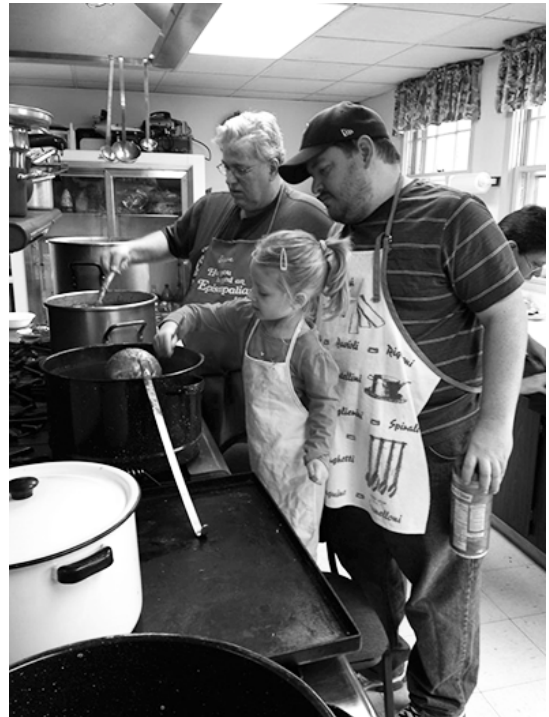
The cook's are shown here hard at work preparing the spaghetti.