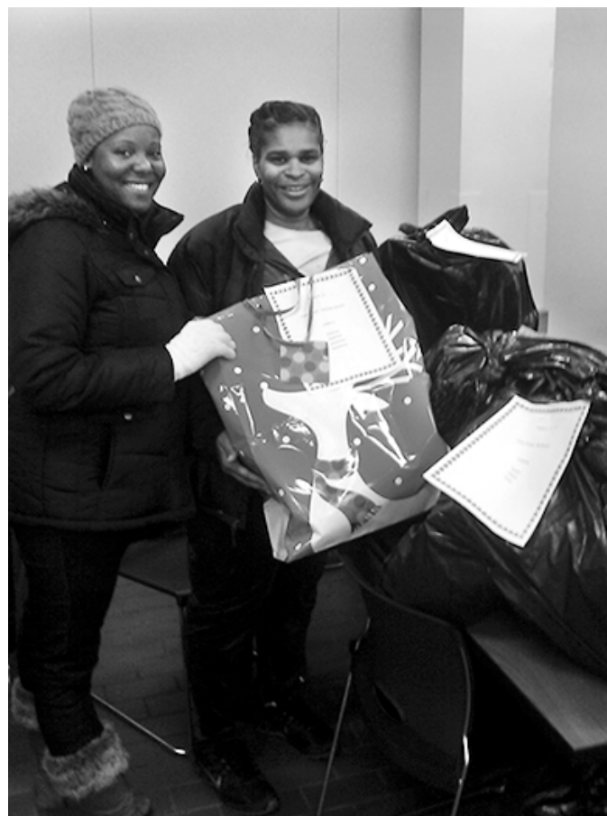
NJ Children & Family Services workers receive St. John's donations.

Once again our choir will participate with several other choirs at the service for Christian Unity to be held on Thursday, January 23, 2014 at 7:30 in the evening, tentatively scheduled for Holy Child Parish, Runnemede. We had hoped we could host this wonderful event this year, but with a new choir director/organist we just don't feel we are ready. And I am still not sure how we can fit in all the choirs as well as those who come to enjoy the service. So we are not sure where this event will take place. We will let everyone know as soon as the decision is made, but mark your calendars now for a service that is always a delight to attend and an opportunity to support our fabulous choir! It really doesn't matter where it is held, as it is always a joy.