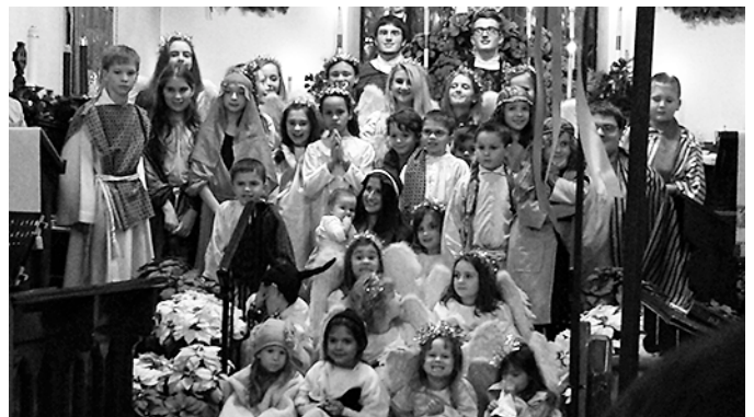
The annual Nativity Pageant on Christmas Eve was presented by the children of St. John's.