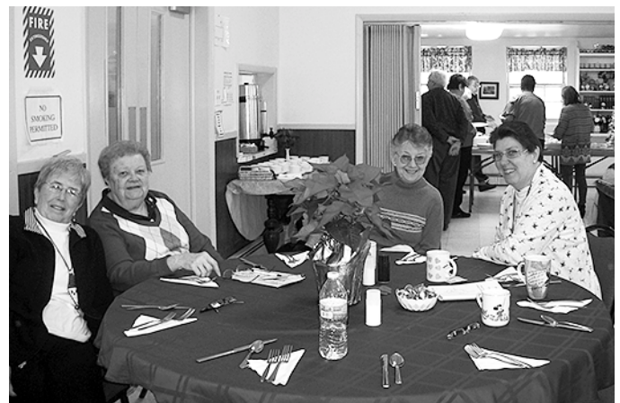
"Girls just want to have fun" at the ECW District meeting in December.