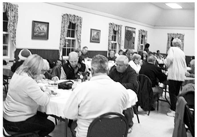
Folks chow down making for another successful St. John's 'Spaghetti Dinner'.