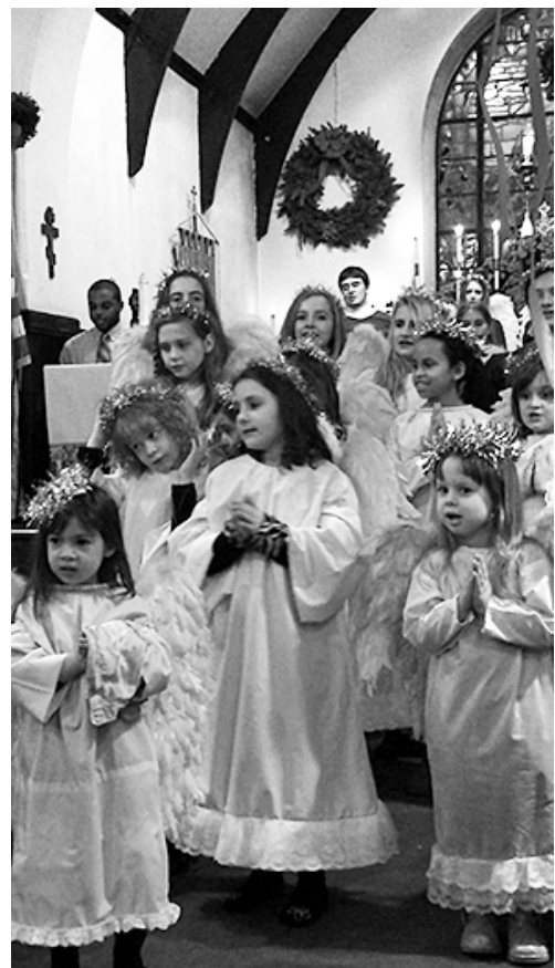
'Sing choirs of Angels....'