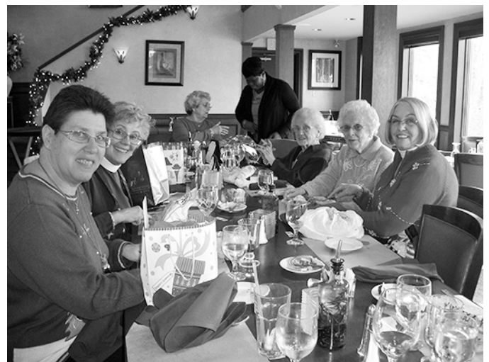
Pictured are the ECW ladies enjoying their Christmas luncheon at Villari's Lakeside Inn on December 20 th. Pollyanna's were exchanged after lunch. Everyone had a super nice time as each year they look forward to the gala event.