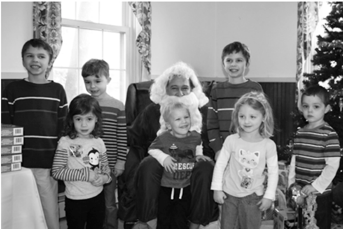
The children were all smiles for 'Breakfast with Santa'.