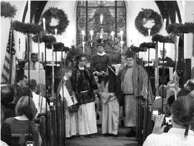
"From the Heaven's above, bearing glad tidings of everlasting love"