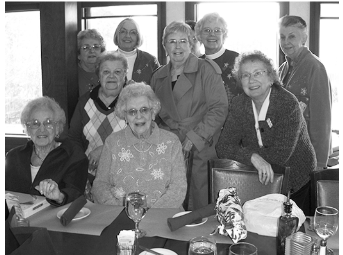
"Our meal was good and the company of each other was special".