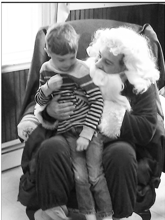
Checking in with Santa