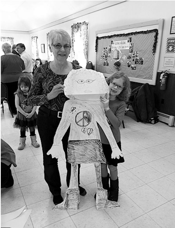
Students met their sponsors and together created their likenesses at the annual Holy Communion Class kickoff coffee hour.