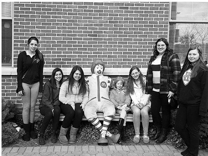
Pictured above and below the GFS MLK day Ronald McDonald house.