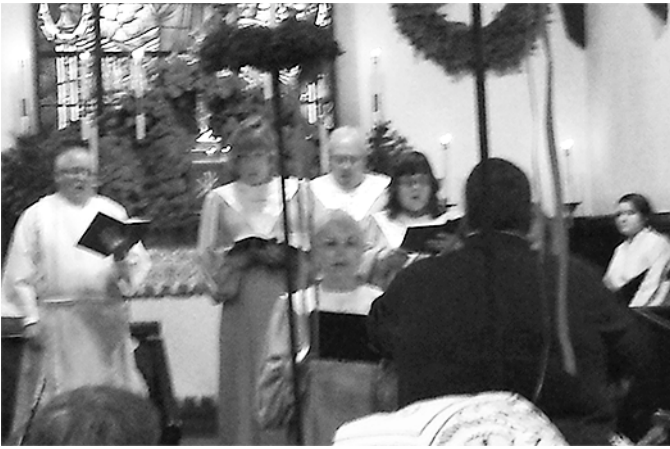
The Choir offers a music selection during lessons and carols.