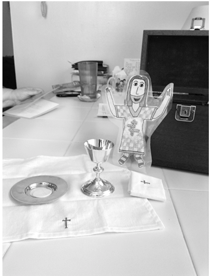
Flat Jesus taking communion out to a shut-in.