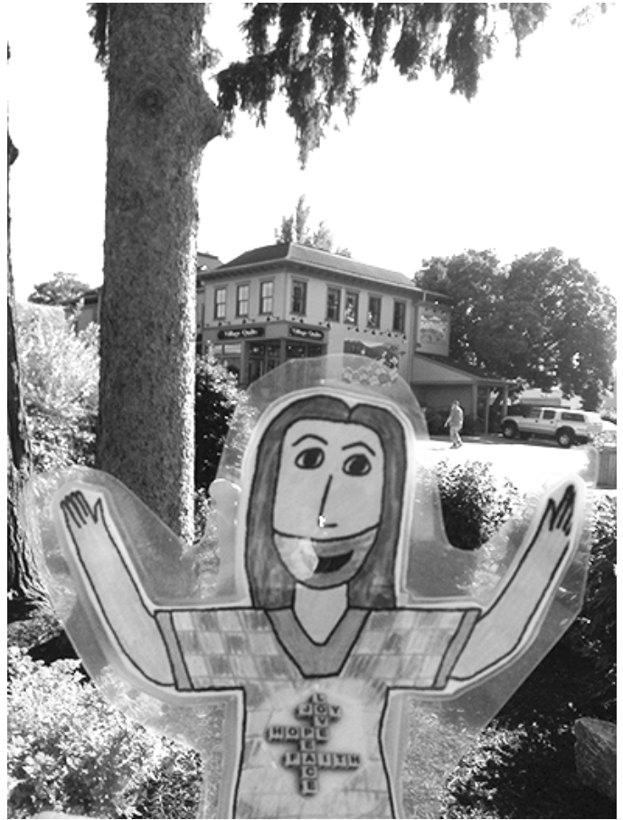
Flat Jesus, visiting Amish Country