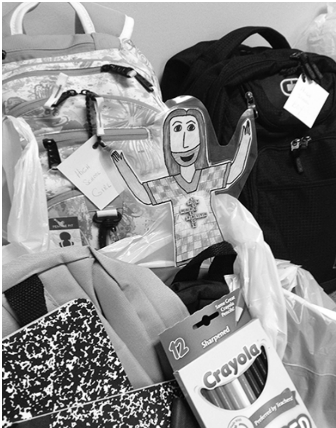
Flat Jesus is excited about all the school supplies we have collected!