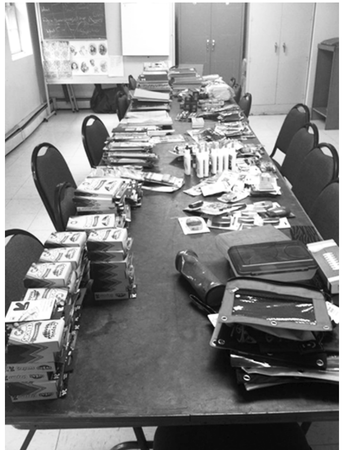
School supplies for loading into backpacks.