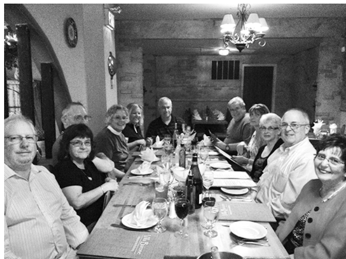
The Choir feasted in Collingswood.