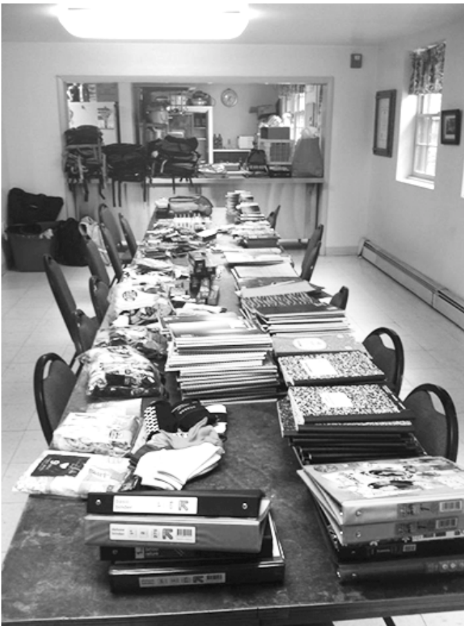
Back pack assembly line.