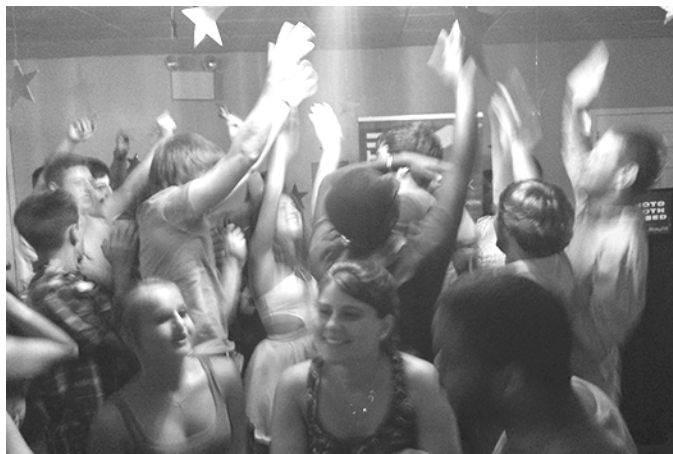
Let the good times roll!