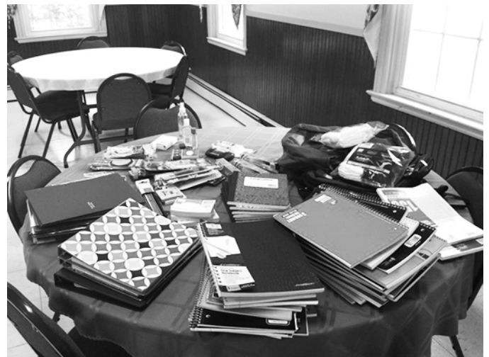
The Parish Hall was loaded with items for the IHOC Backpacks.