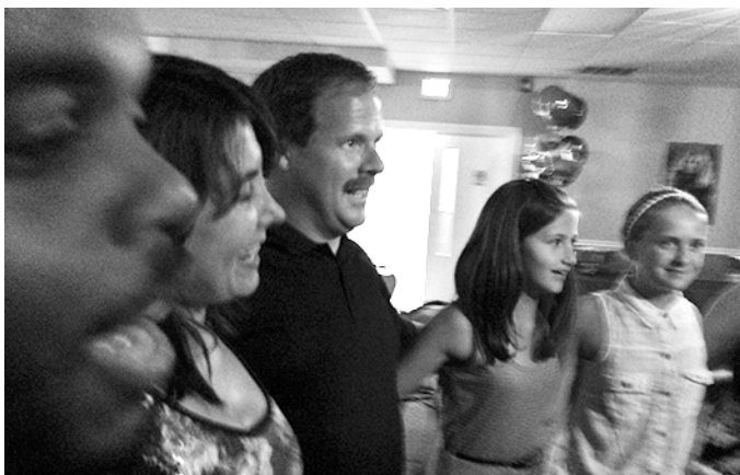
It's party time!!!