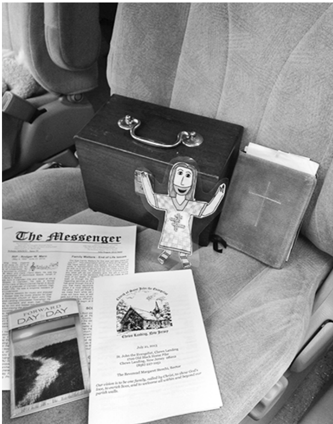
Flat Jesus on the road again with the bread and the wine!