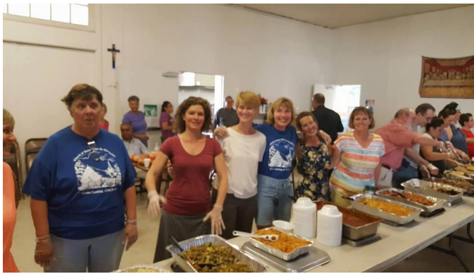
The St. John's gang ready to serve the hungry at St. Andrews on July 24 th .