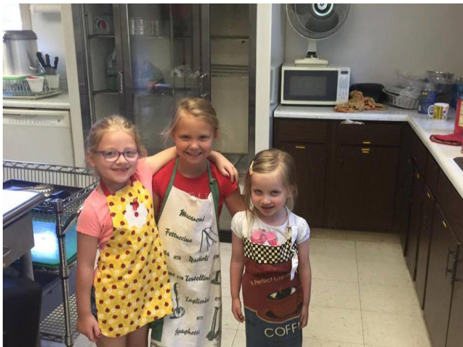
The best helpers from St. John's feeding the hungry at St. Andrews.

We join St. Andrews to help feed hungry men, women, and children at St. Paul's whenever we have a month in which there are 'five (5)' Sundays. We take the 'fourth' Sunday of that month. Our next opportunity for this wonderful outreach will take place on October 23. If you have any toiletries that you picked up while vacationing this summer and realize you really don't need them, the homeless are in desperate need of them. Bring them to the parish hall and we will see to it they get into the hands of folks who will really appreciate them. If you are sorting your fall/winter wardrobe, we can also take warmer clothes in October. Please wait until that weekend to bring them to the parish hall, and please remember someone has to carry your bags up a very long stairway so don't overfill them!