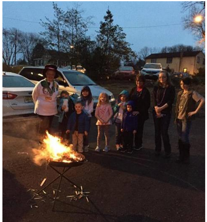
The annual burning of the palms on Shrove Tuesday in the parking lot providing for the ashes for distribution at the Ash Wednesday services.

This is one of those things we do offer in The Episcopal Church but few are aware. Lent is one of the times of year this is often performed. Of course, the Rector is available for appointments for confession at any time.