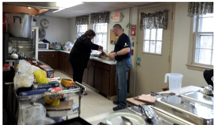
Shown above and below food preparation for the annual parish meeting.