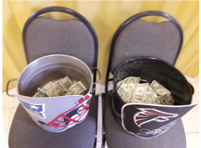
"Souper Bowl" Sunday, Super Bowl prediction unfortunately favored the Atlanta Falcons 80 - 33. Proceeds went to help feed the homeless at St. Paul's, Camden.