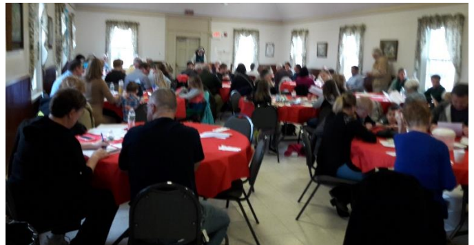
A view from congregants.