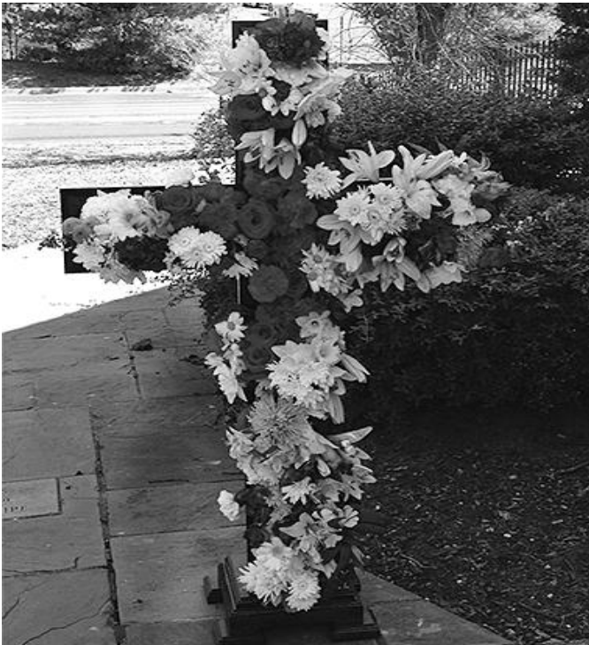
The annual Flowering of the Cross

'He is Risen, He is Risen' 'The Lord is Risen Indeed'