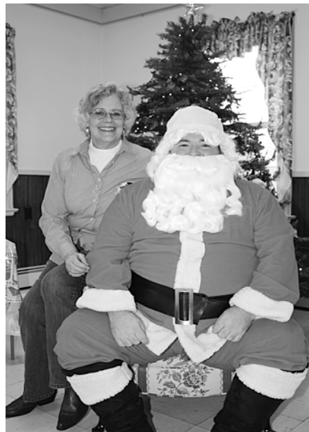
Our Rector with Santa