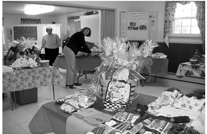
ECW Craft Fair pictures of the courtesy Sallie Jones.