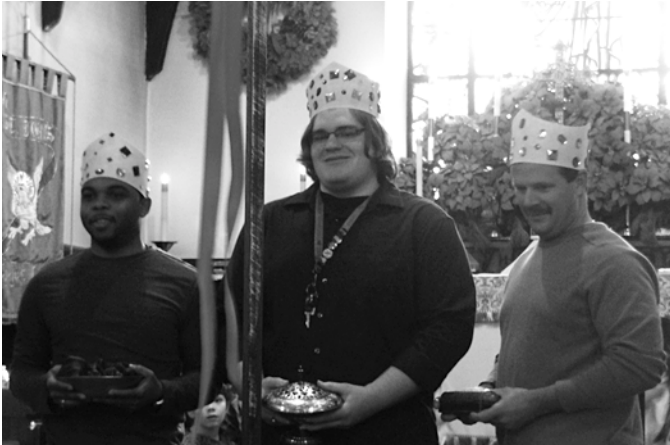
Celebrating the feast of the Epiphany, the three Kings present their gifts.