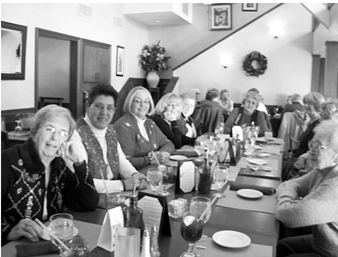
ECW Luncheon pictures courtesy Sallie Jones.