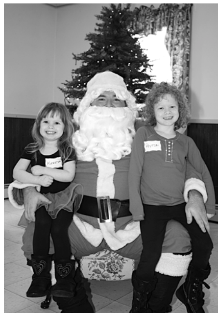
Happy to see Santa