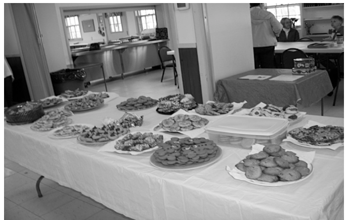
ECW cookie exchange pictures