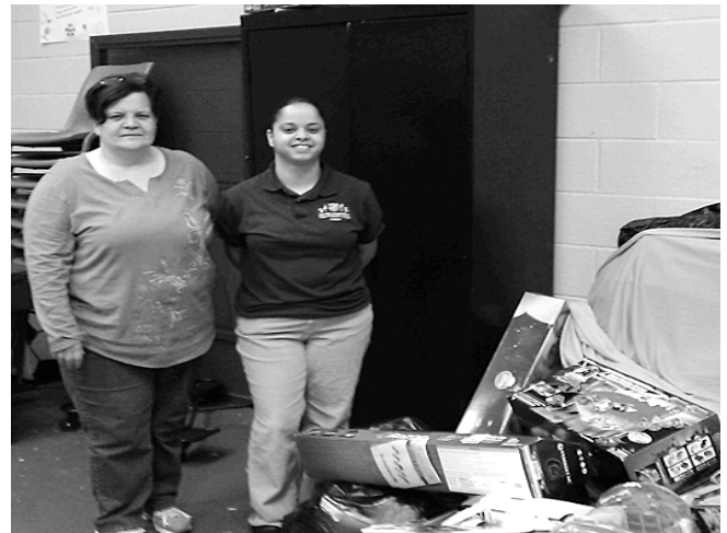
"Thank you to everyone who brought in toys to the Breakfast with Santa ".

Tired of those boxed and canned soups? Head over to the parish hall on Saturday, January 12 for a variety of delicious soups on sail by the St. John's ECW. The quart soup selections go on sale at 9:00 am. Don't miss this opportunity to stock up on some of the best homemade soup in New Jersey!