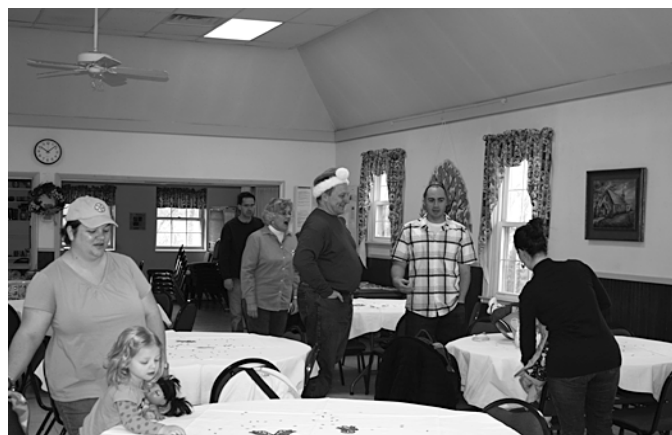
Enjoying breakfast with Santa.