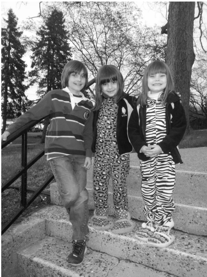
They were ready for the Easter Vigil.