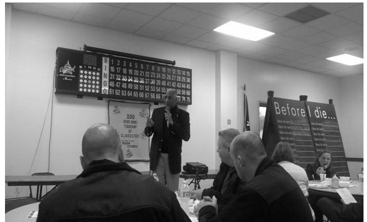
Keynote speaker addresses the attendees.