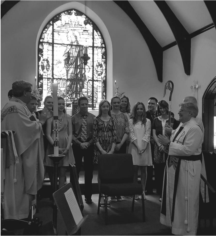
Introducing those confirmed and those received.