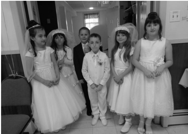
Meet the Holy Communion Class of 2016.